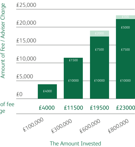
What you will pay based on an example of maximum fees for Advice and Implementation